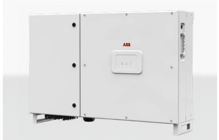
ABB string inverters PVS-50/60-TL