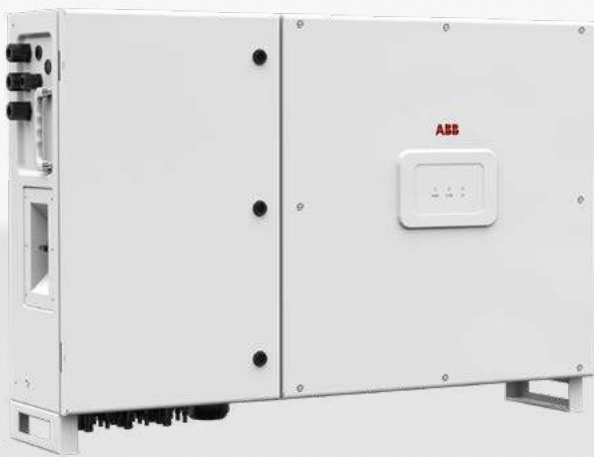
— PVS-50/60-TL string inverter

This new addition to the PVS string inverter family, with 3 independent MPPT and power ratings of up to 60 kW, has been designed with the objective to maximize the ROI in large systems with all the advantages of a decentralized configuration for both rooftop and ground-mounted installations.